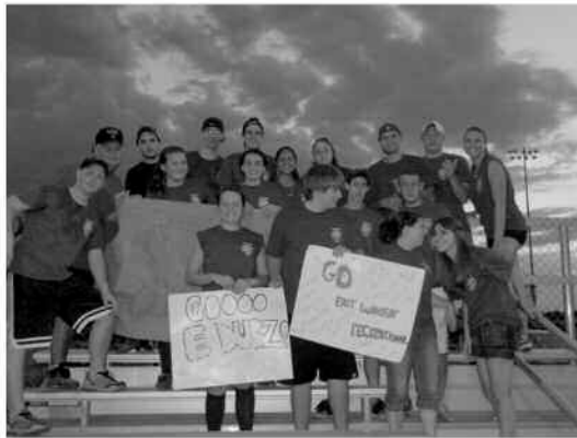
2008 Summer Camp Staff

Children in Grades 7-8 attended the Intermediate Day Camp held at the Kreps School. Activities included swimming, organized sports, and special lunch days at restaurants such as The Americana Diner, Marco Polo Buffet and Dairy Queen's Grill and Chill. The campers also went on a few trips per week to such destinations as Combat Zone Laser Tag and Seaside Heights beach and boardwalk.