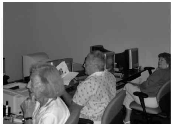
Seniors take part in the new Digital Photography Class